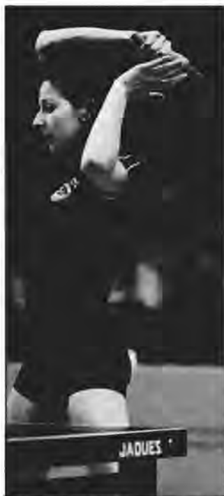
'Playboy' he grinned at his courtside interview.