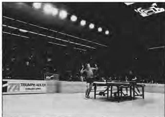
The television arena at Brighton

STIGA ROBOT MACHINE with collector net and oscillator. Excellent condition. £350. Phone: 021-354 7751.