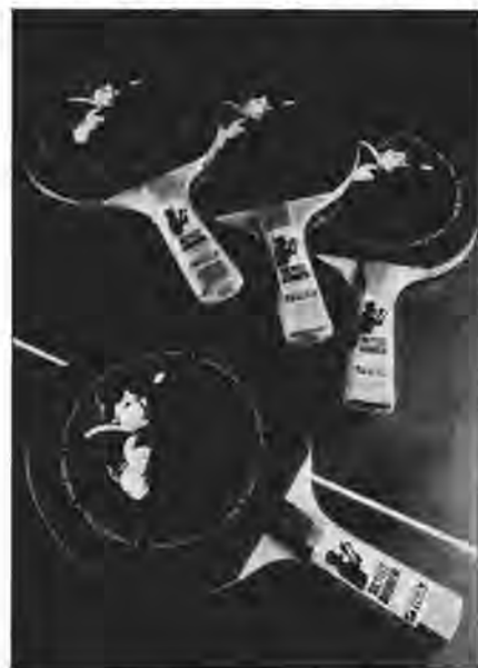
The Skylet Andrew Bat - a new addition to the Stiga Range, retailing at £5.00